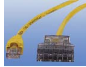
Cat 5e 110 to RJ45 Patch Cord