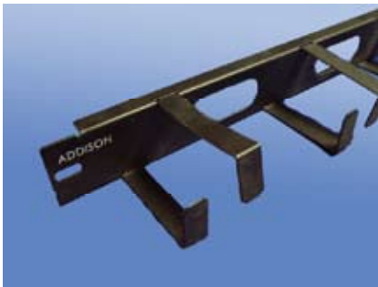
1U Cable Management Panel