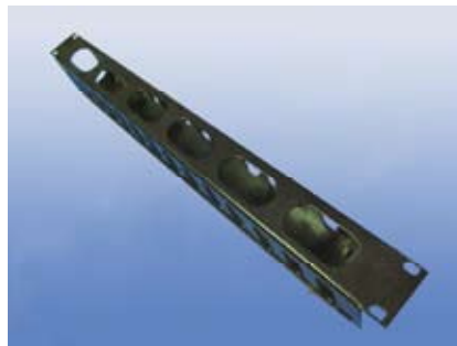
Duct Type Cable Management Panel