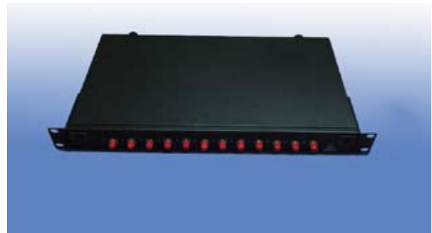
12 Port 1U Rackmount Fiber Patch Panel With Splicing