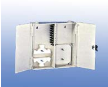
12 Port Wall Mount Fiber Patch Panel