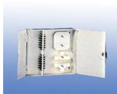
24 Port Wall Mount Fiber Patch Panel